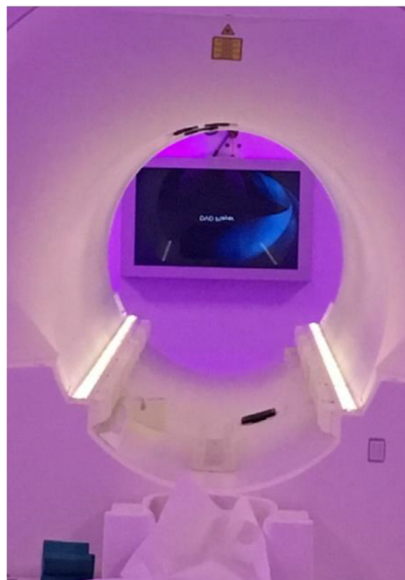
Fig. 1. Images depicting the use of film played on a screen within the scanning room [Image shared with permission, GOSH].

Another non-pharmacological approach is the use of melatonin, a natural sleep cycle regulator that can induce sleep in children [27] due to its mild sedative and hypnotic effect [28]. Pasini et al. [27] used 10 mg of melatonin added to a milk drink prior to the MRI in preschool children. This achieved adequate levels of sedation, allowing successful completion of the MRI scan in 14/15 patients. A recent retrospective study evaluated the efficacy of melatonin in 64 infants and young children in neuro-paediatric MRI. They found that 77% of scans were rated diagnostically acceptable by a paediatric neuroradiologist. However, only 22% of scans were free of movement artefacts in any sequence [28]. The increased success rates may be due to the sedative effect of melatonin rather than a sleep-inducing effect. Melatonin is a much safer option than sedation/GA as no studies reported adverse events or side effects [27,28]. Furthermore, it can be used in conjunction with the feed and wrap approach, if the infant wakes up during the scan as it is cost-effective, efficacious and can be administered in follow-up MRI scans, if required.