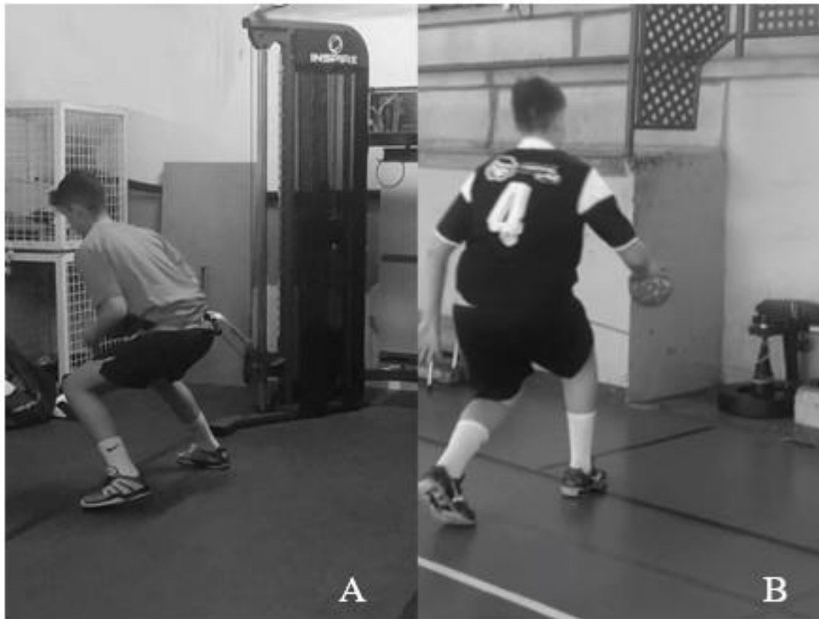
Figure 2. Cable resistance training (A) and iso-inertial training (B).