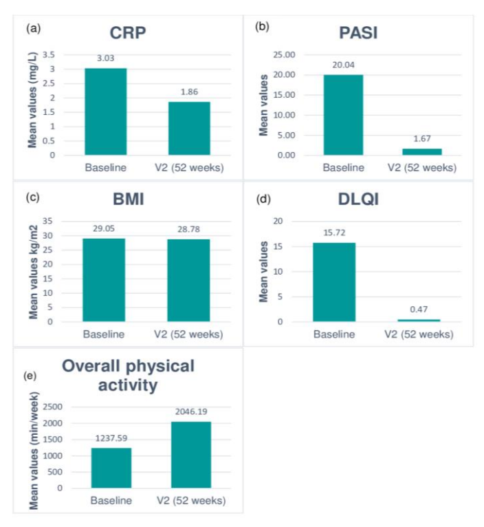
Figure 2: Final results of 52 weeks follow-up [comparison between baseline visit and visit 2 (V2)]; (a) CRP, change in mean value: -1.17, p-value =0.003; (b) PASI, change in mean value: -18.37, p-value <0.001; (c) BMI, change in mean value: -0.27, p-value =0.358; (d) DLQI, change in mean value: -15.25, p-value <0.001; (e) Overall physical activity, change in mean value: 808.60, p-value <0.001. N=32.