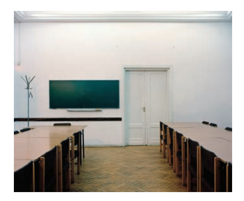
Union of Polish Teachers Zwiazek Nauczycielstwa Polskiego ZNP, Warsaw, Poland