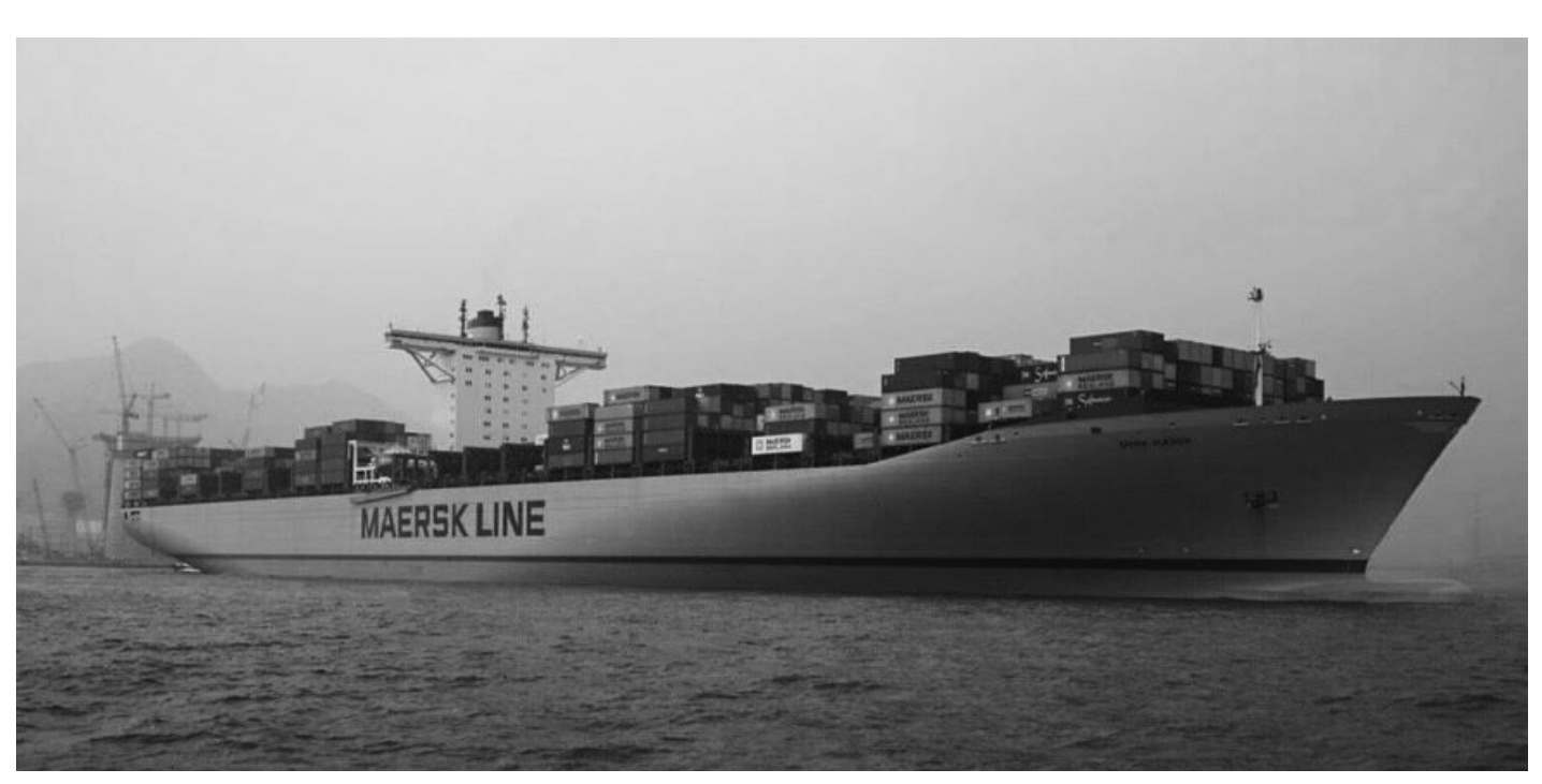
Emma Maersk potential as fixed-wing aircraft carrier or ISO Containerised Guided Weapons Ship.

Blake [28] also stipulates as critical, the management of the flows of systems, crews and materiel between the Navy; its Auxiliary and Support elements and the Merchant Marine. He envisages the capitalisation and rescaling of Naval and Auxiliary Fleets through the application of 'fit-for-purpose', versatilely modularised merchant hulls – in a way also to grow and sustain (red flagged) merchant marines and ship-building industries [3, 28]