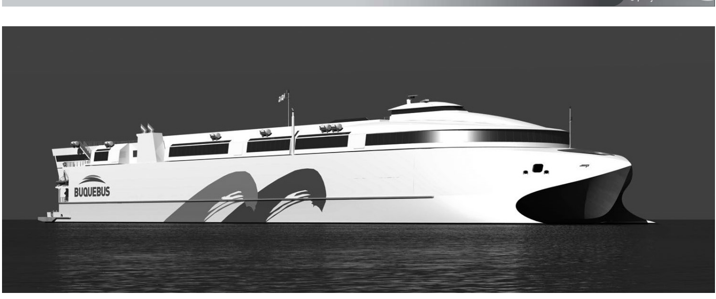
Australian Made and Designed INCAT 096.

ones. The enablers to critical deeper thinking, being research and education, were not used or were 'drowned out'. [18] This potential illusory thinking of 'saving money and time' is most recently evident in the Canadian decision to look for an existing frigate design.